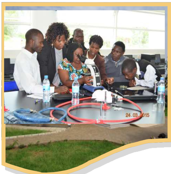
Retooling project's students

report for the financial statement year 2013/14. Also, on the procurement audit of 2015, MUCE scored 86% and hence, being among the 27 out of 80 procuring entities that attained satisfactory compliance levels above the PPRA target of 75%.