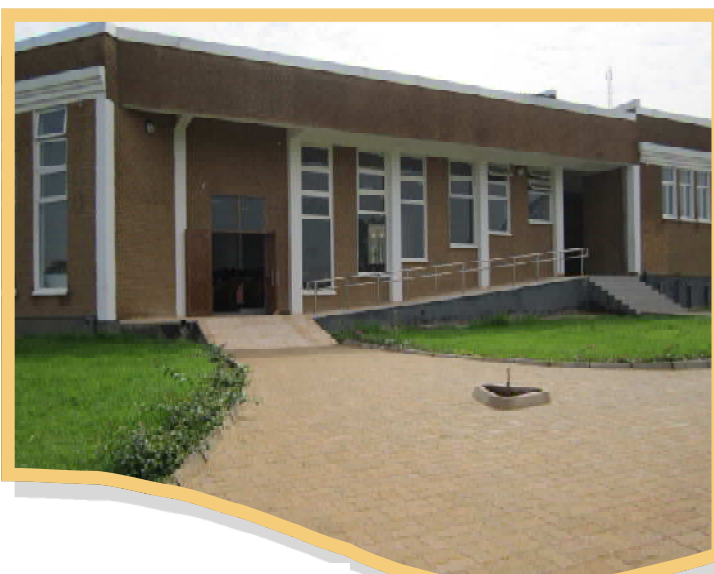
New lecture theatre